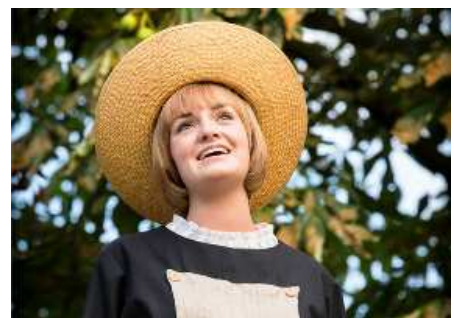
The Sound of Music