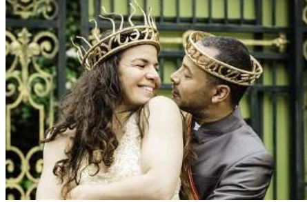
The Winter's Tale re-imagined