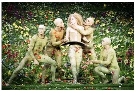
A Midsummer Night's Dream