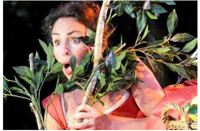
Much Ado About Nothing