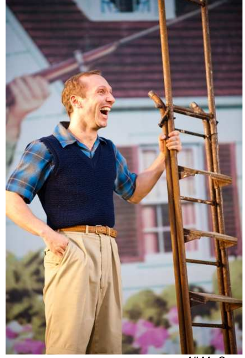
All My Sons

The Regent's Park Open Air Theatre is located in Queen Mary's Garden - within Regent's Park - and is a 10 minute walk from Baker Street underground station.