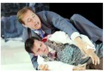
The Importance of being Ernest