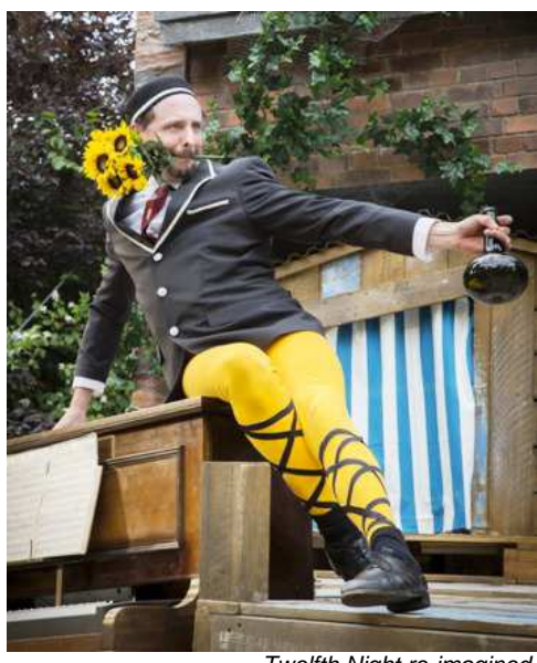
Twelfth Night re-imagined