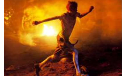
Lord of the Flies