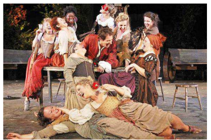
The Beggar's Opera