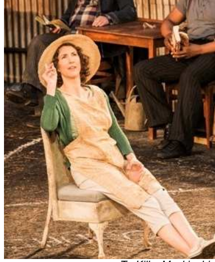
To Kill a Mockingbird