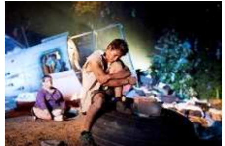
Lord of the Flies